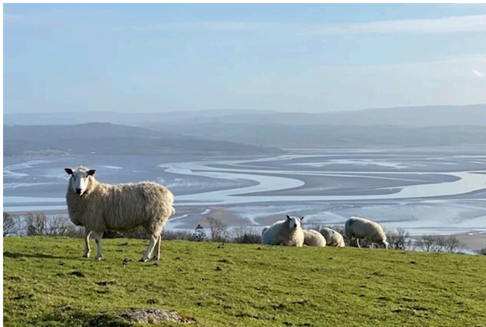
Morecambe Bay, with thanks to Penny Ward.

Do you have a photograph of a Cumbrian landscape from your local area to share? Please send it to admin@churchestogethercumbria.org.uk for it to be included